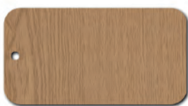
D9103 PR Light oak