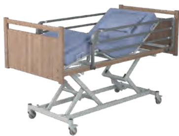
L-02 Wooden bed end with wooden slat