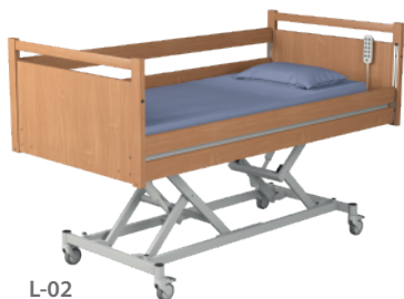
L-02 Wooden bed end with wooden slat