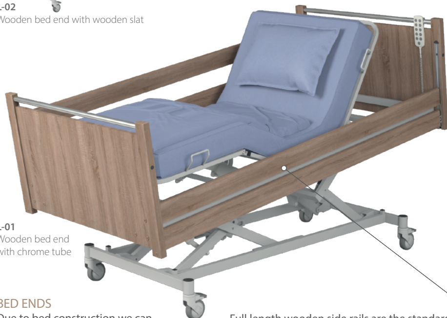
L-01 Wooden bed end with chrome tube