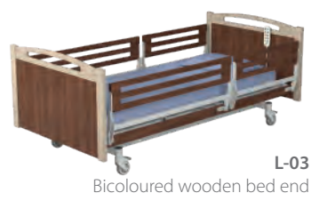
L-03 Bicoloured wooden bed end