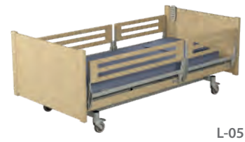
L-05 Solid wooden bed end

BED VISUALISATION HAS AN ILLUSTRATIVE CHARACTER. PRESENTED COLOURS MAY VARY FROM THE ORIGINAL COLOURS.