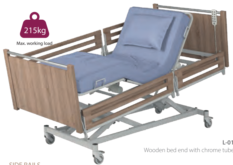
L-01 Wooden bed end with chrome tube