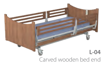
L-04 Carved wooden bed end