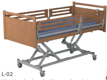
L-02 Wooden bed end with wooden slat

While designing Leo we paid careful attention to bed height adjustment - it is almost 50cm. Lowest position -30cm provides comfortable usage of bed and also reduces risk of falling. Maximum height - almost 80cm-remarkably ease care of lying patients for medical staff.