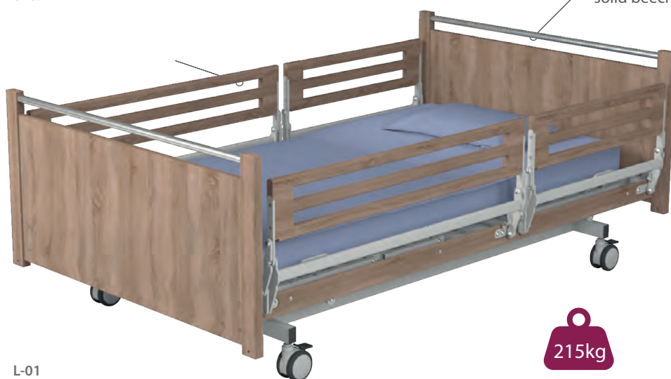
L-01 Wooden bed end with chrome tube

Due to bed construction we can offer wide range of bed ends, made of laminated board and solid beech wood.