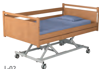
L-02 Wooden bed end with wooden slat