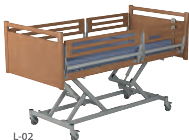
L-02 Wooden bed end with wooden slat