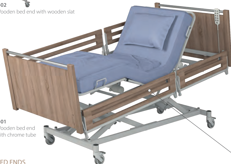
L-01 Wooden bed end with chrome tube

BED ENDS are made of laminated board and solid beech wood. Due to bed construction we can offer detachable foot/head ends.